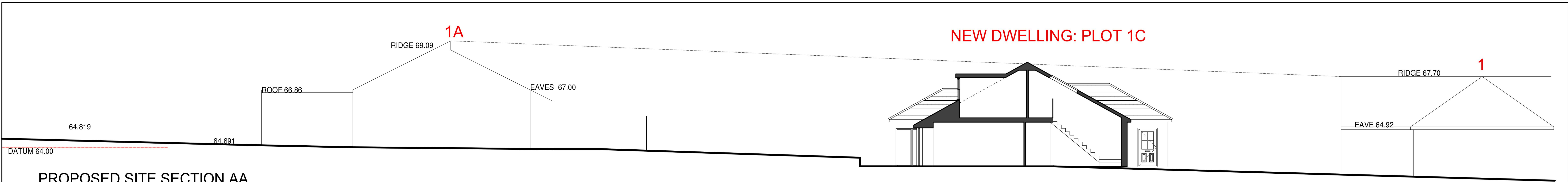
PROPOSED SITE SECTION AA