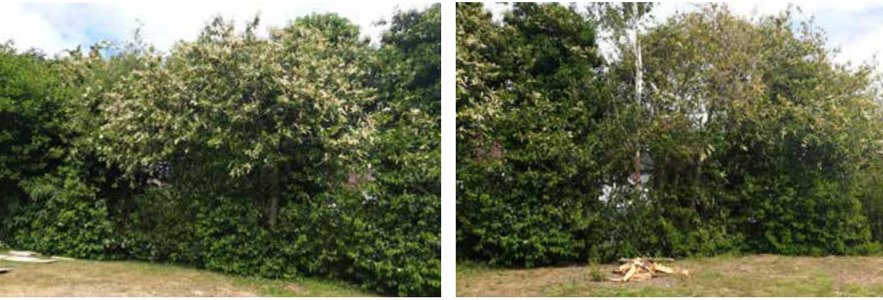
Existing vegetation to be retained to boundary with Glendale Avenue properties

The dense and mature existing vegetation forms a screen boundary with the Glendale Avenue properties. The planting will be retained and reinforced with a new hedge and new trees to the east. This will help screen the new development from adjacent dwellings. Low ornamental planting in a raised bed will soften the close board fence between 1A and 1C. A semi native hedge will provide screening to the western boundary from Shelley Close.