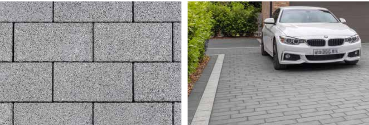
Mid grey paving blocks

Two new bays will extend the existing drive to allow for the appropriate parking provision. They will be surfaced with mid grey concrete blocks with a silver grey edging and kerb. The texture will contrast with the road whilst the colours will harmonise with the proposed path linking the parking bays to the rear garden.