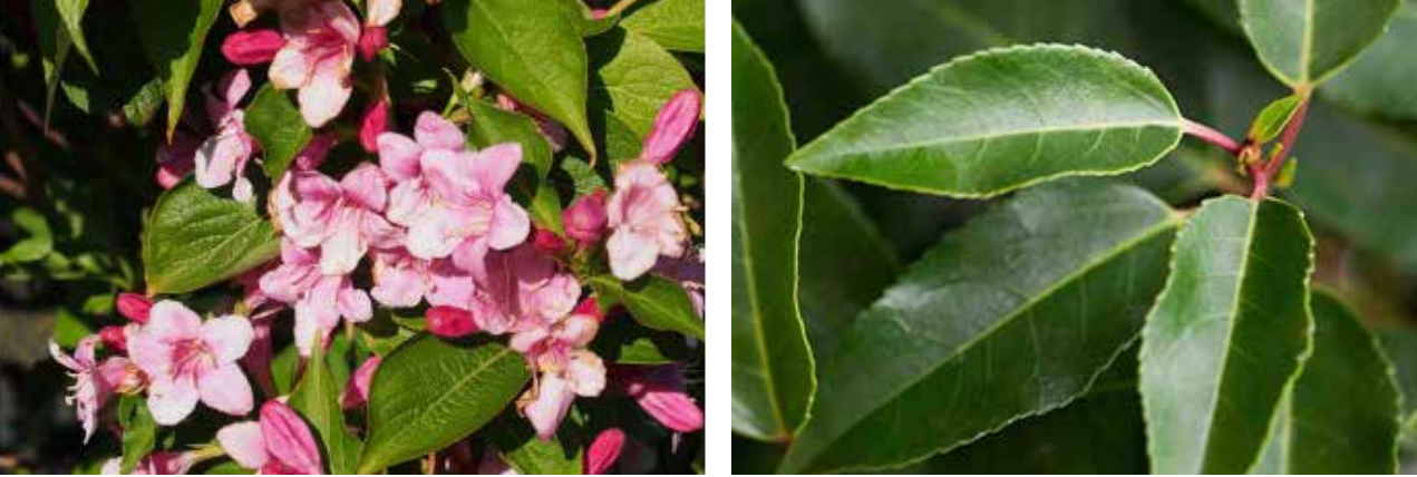
Weigela florida 'Rosea'