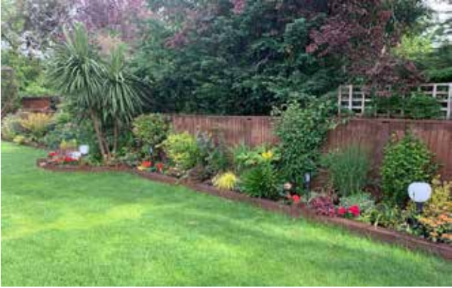
Low ornamental planting in raised planting bed

The garden will offer usable space with a grassed area and a patio for residents. The hedge provides a simple delineation from adjacent property (1A) and Shelley Close. It not only provides screening but also continues the existing eastern boundary planting. The patio and the path linking the rear and the side of the property will be paved with mid grey flags to complement the proposed house façade.